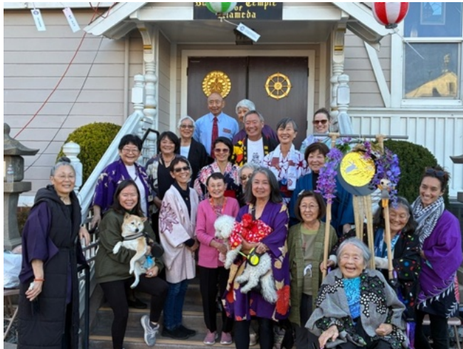
Photo Ops: The FBWA requested photos for a slideshow they will be presenting at the upcoming Representatives' Meeting and next year's national conference. They also wanted photos of our members at our Obon. It is always a challenge to gather everyone, but we were able to get a lot of our members during the 2-day Obon weekend.

Obon: Many thanks to Toban Group #1 for providing light refreshments following the afternoon service. This year there was a meditation walk included in the service, so it was a nice treat to have the delicious cake afterwards!