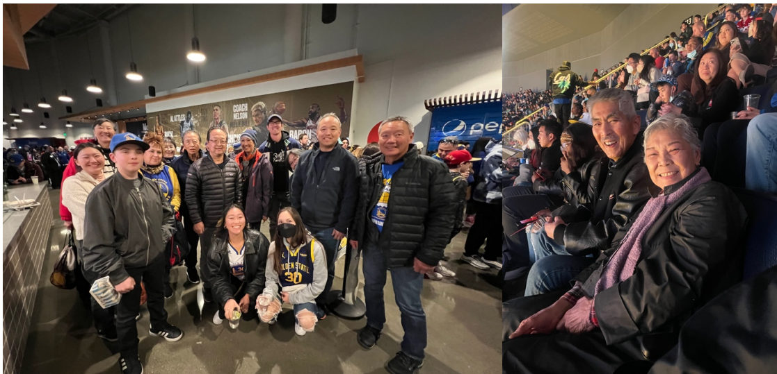
BTOA sangha goes to the Warriors' game.