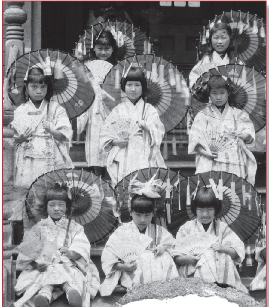
The Temple circa 1930s.... know what's going on here?

After Sunday service in the social hall there will be old photos and documents to look at from 1898 to the late 1950s era BTOA and Buena Vista, family photos, Nihonmachi Alameda, sports and WWII items.