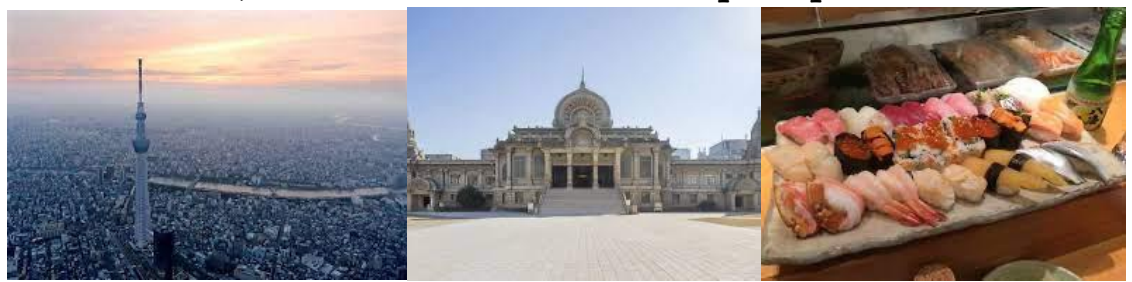
May 10-14: Stay in Kyoto; Participate in Joint Celebration at Hongwanji, Attend WBWC Conference, Go to Mt. Hiei

May 7-10: Stay in Tokyo; Visit Tsukiji Hongwanji, see Tsukiji Outer Market, visit other areas like Tokyo Sky Tree.