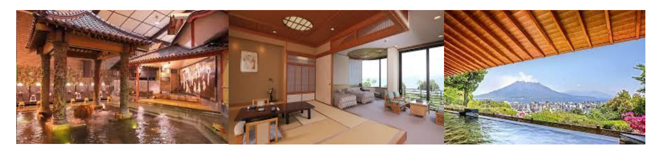
May 19: Return Home Kagoshima to Haneda to SFO