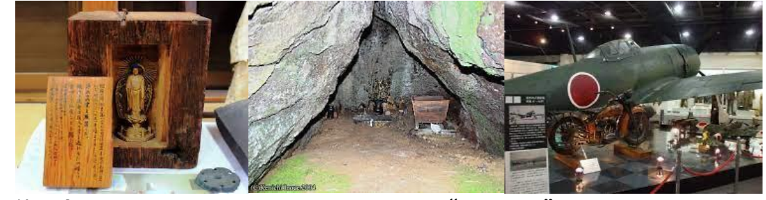
May 17-18: Go to Kagoshima; Tour of the "Kakure" Nembutsu where we visit the various sites where Jodo Shinshu followers worshipped in secret hiding areas in order to evade persecution. Visit Chiran Peace Museum that has an exhibit on kamikaze pilots. We will stay at another hotel known for its onsen hot baths. We will go to a shochu distillery and eat, eat, EAT!