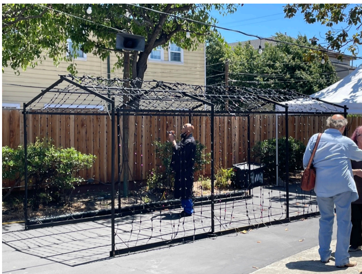
Interactive music/light structure