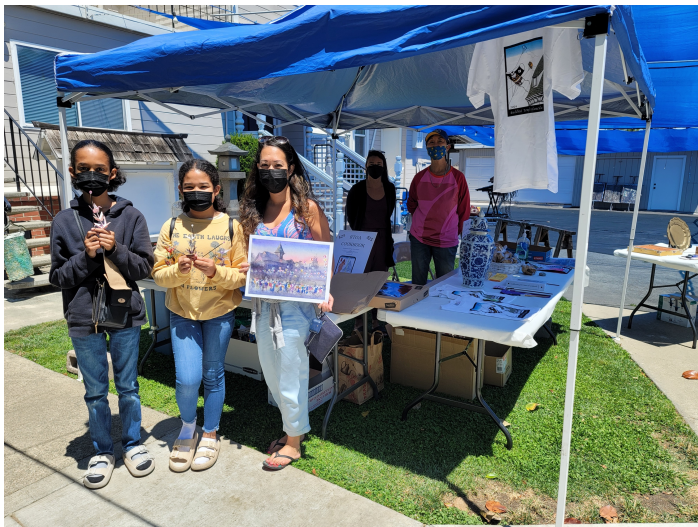
Dharma School kids and parents help out

https://photos.google.com/share/AF1QipOKrussdJmO0nS07XEmRTZOYLjBZ_-VIYhvF60Khk-cYvhj0LZTTpuSQkOh3MOciA/photo/AF1QipM_qpBBzwSNaOTkkXcgFrCd2rKY_DDurH4kGJWC?key=WFJWamxuUU4YWs2aWV2Q2xGcDVFUTNSX3UyNGFB